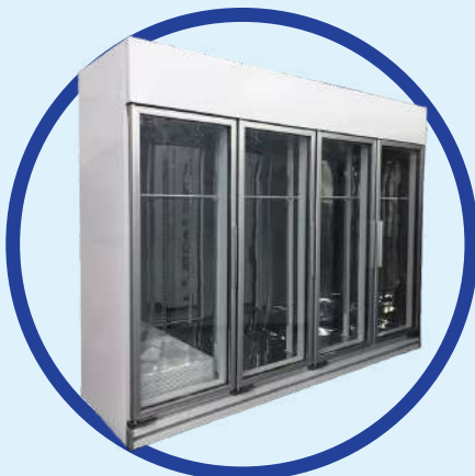
4 DOOR DISPLAY CHILLER