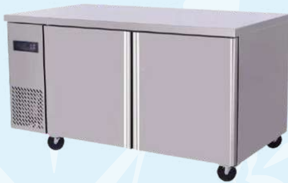
2 Door ** Freezer ** (1.2M) YD-1200CFM

Suitable for meats, drinks, sauce, vegetables and etc.