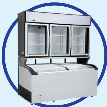
COMBINED ISLAND FREEZER