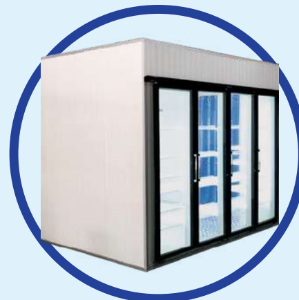
COLD ROOM & MORE