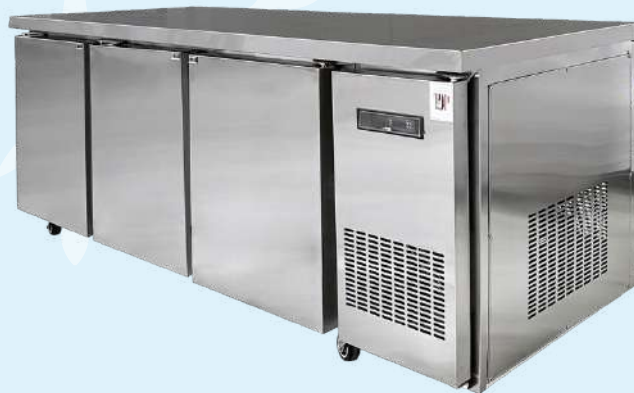
3 Door ** Chiller / Freezer ** (2.1M) EQ-2100CCM/ CFM