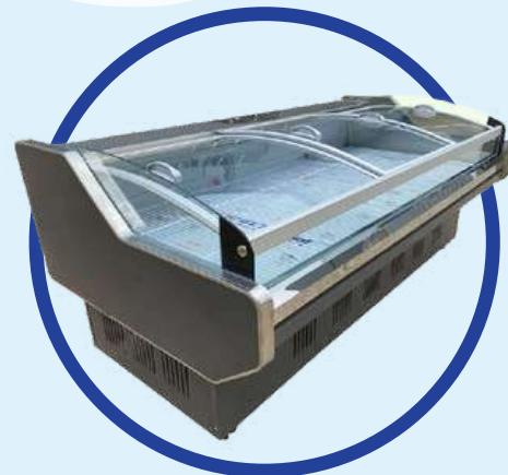
FLAT MEAT CHILLER