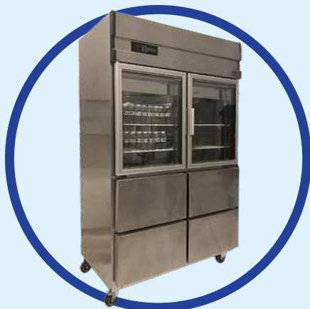
CHILLER FREEZER WITH CUSTOMIZED DRAWER