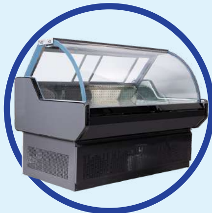
ARC MEAT FREEZER