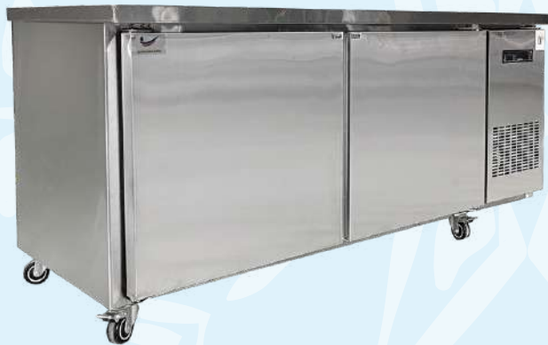
2 Door ** Chiller / Freezer ** (1.2M) EQ-1200CCM/ CFM (1.5M) EQ-1500CCM/ CFM (1.8M) EQ-1800CCM/ CFM