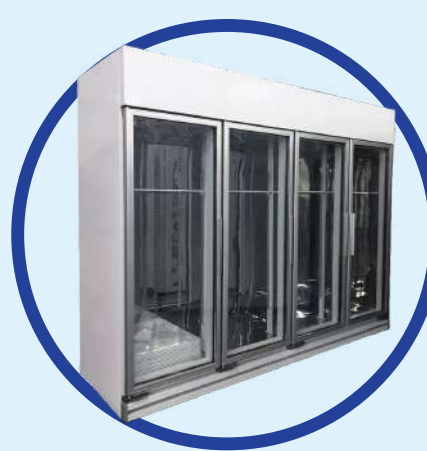
4 DOOR DISPLAY CHILLER