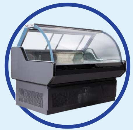
ARC MEAT FREEZER