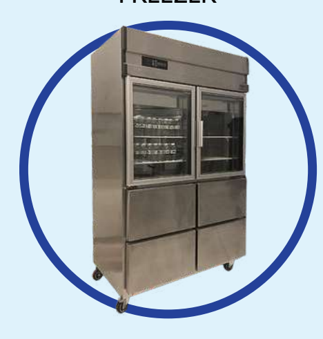
CHILLER FREEZER WITH CUSTOMIZED DRAWER