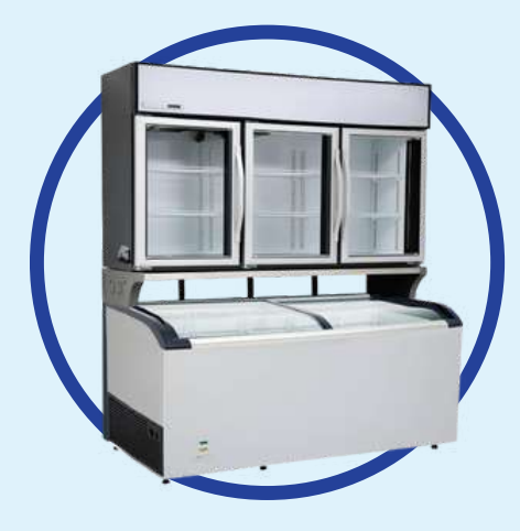
COMBINED ISLAND FREEZER