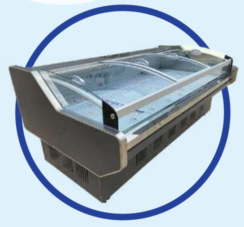
FLAT MEAT CHILLER