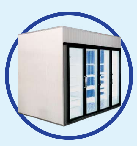
COLD ROOM & MORE